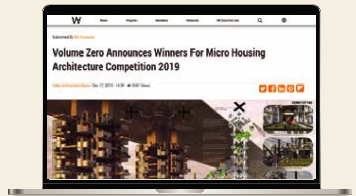
Microhousing Competition Winner's published on worldarchitecture.org